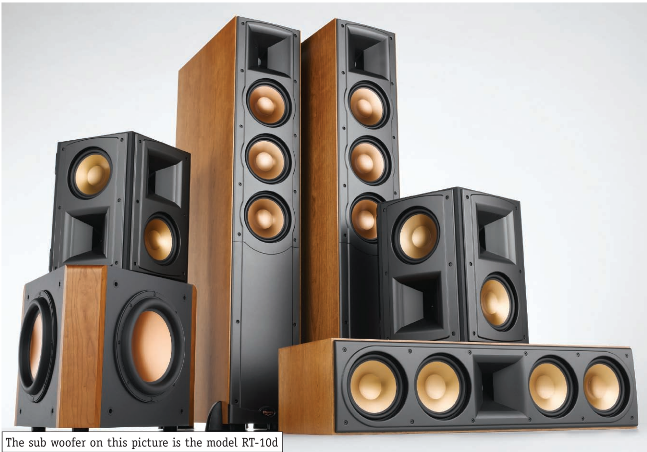
The sub woofer on this picture is the model RT-10d

Orchestra wafted us away into the poignant and intense world of the Near-East. Synthesized violins created a feeling of urgency at a rhythm that became more and more breakneck. We heard the sparkle of tambourines as the music went forward in two tempi, smooth and quick at the same time. The Klipsch speakers not only mirrored the rhythms, they also widened the soundscape.